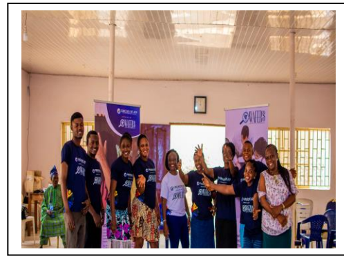
Volunteers and some team members during the launching of Circles of Joy project