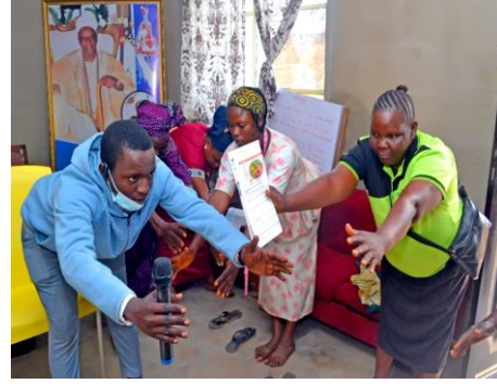
Physiotherapy exercise training for participants