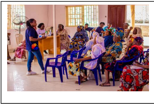
Presentation to participants during the launch of Circles of Joy project