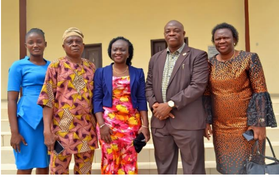
JIGSAW-A's project dissemination in Oyo State Ibadan